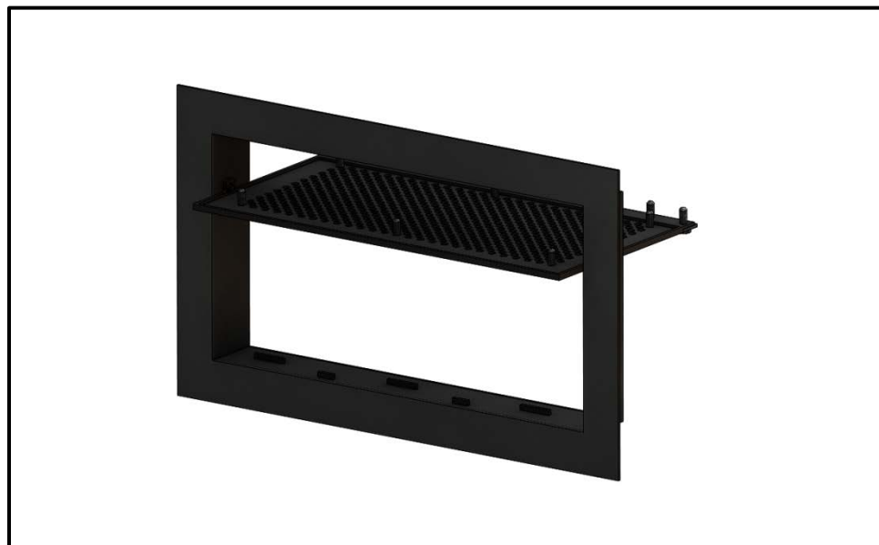
FIGURE 2—MODEL FFV-1608 FREEDOM FLOOD VENT™: SHOWN WITH FLOOD DOOR PIVOTED OPEN