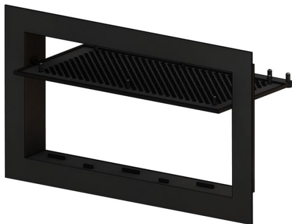
FIGURE 2—MODEL FFV-1608 FREEDOM FLOOD VENT ® : SHOWN WITH FLOOD DOOR PIVOTED OPEN